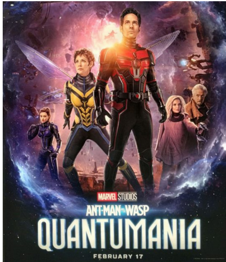
Ant-Man and the Wasp: Quantumania can be seen in theaters and will likely be available to stream on Disney+ soon.