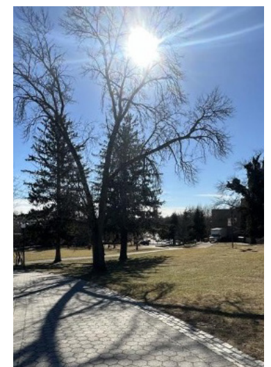
WCC Campus shortly before the end of DST.

Only 70 countries follow some system similar to Daylight Savings Time, mainly in much of Europe, North America, parts of South America, and Australia. Many countries in Africa and Asia don’t follow Daylight Savings Time since many of these countries are on the equator, thereby already receiving much daylight, and lack traditional seasons throughout the year.